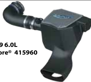
G8 08-09 6.0L PowerCore® 415960