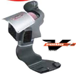
Duramax 08-09 LMM Primo 15166 PowerCore® 151666 CAS 35066