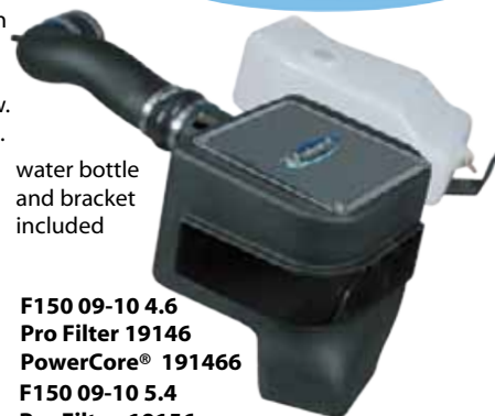
water bottle and bracket included

Stainless Steel Clamps: We only use marine-grade, stainless steel clamps that provide optimal performance to provide a solid seal that won't loosen or deteriorate.