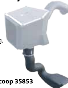
Air Scoop 35853

This accessory scoop maintains the horsepower gains and increases mpg only during highway driving. A true Ram Air scoop