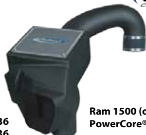
Ram 1500 (only) 08-10 PowerCore® 160576

This accessory scoop maintains the horsepower gains and increases mpg only during highway driving. A true Ram Air scoop