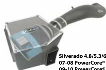
Silverado 4.8/5.3/6.0 07-08 PowerCore® 152536 09-10 PowerCore® 153536