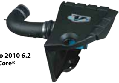
Camaro 2010 6.2 PowerCore®