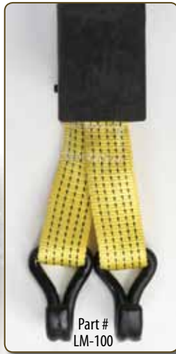
Part # LM-100