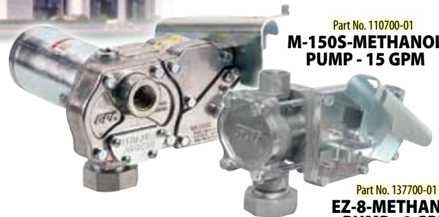
Part No. 110700-01 M-150S-METHANOL PUMP - 15 GPM

GPI offers a full line of gasoline transfer pumps, diesel transfer pumps and fuel meters designed specifically for agricultural fueling, construction fueling and fleet fueling applications. GPI products are designed, engineered and tested to exacting standards before being introduced to the market. Products are 100% functionally tested to ensure years of dependable service.