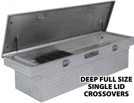
DEEP FULL SIZE SINGLE LID CROSSOVERS