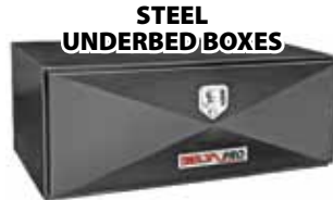
STEEL UNDERBED BOXES