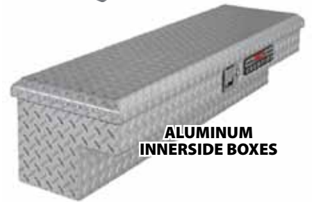
ALUMINUM INNERSIDE BOXES