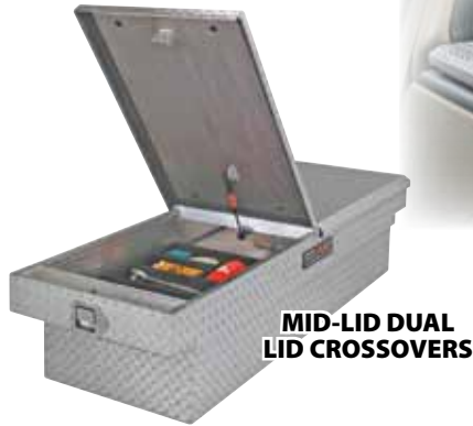
MID-LID DUAL LID CROSSOVERS