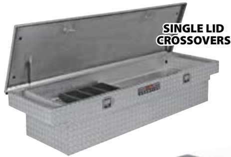
SINGLE LID CROSSOVERS