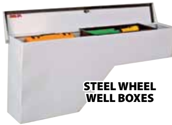
STEEL WHEEL WELL BOXES