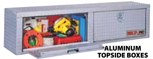
ALUMINUM TOPSIDE BOXES