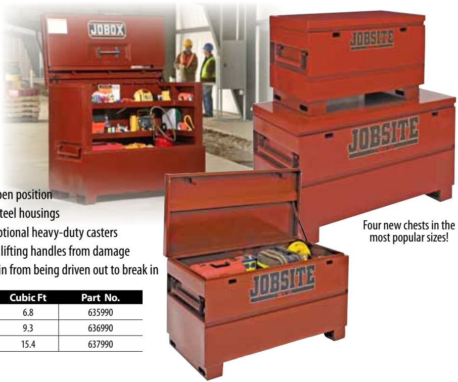
Four new chests in the most popular sizes!