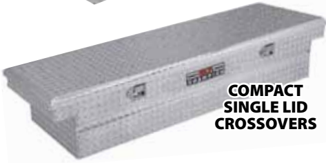
COMPACT SINGLE LID CROSSOVERS