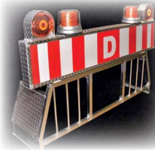
Part No. 925LED