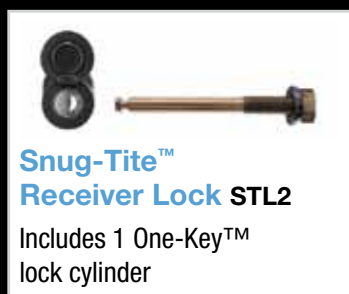
Snug-Tite™ Receiver Lock STL2