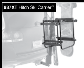
987XT Hitch Ski Carrier™