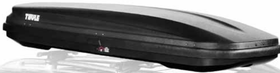
602 Ascent™ 1100