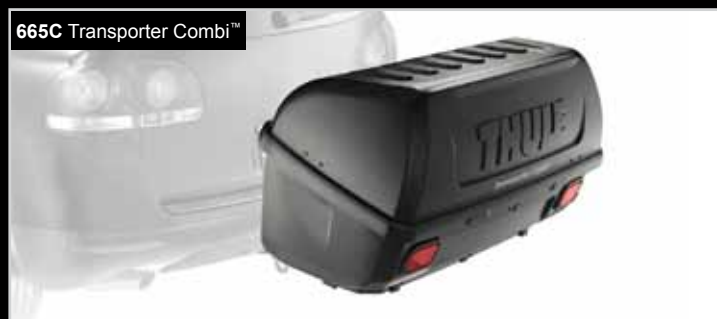
665C Transporter Combi™