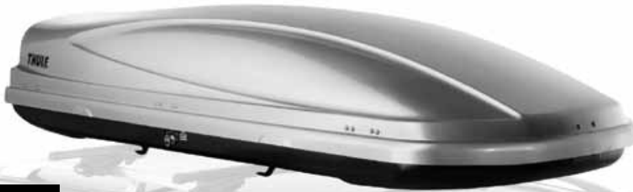
688XT Atlantis™ 2100