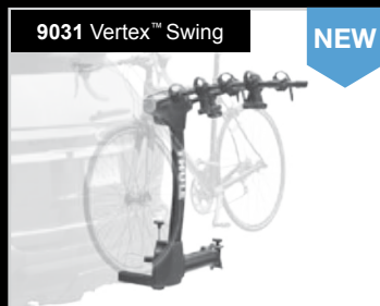
9031 Vertex™ Swing