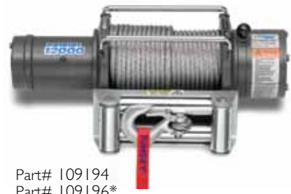
Part# 109194 Part# 109196*