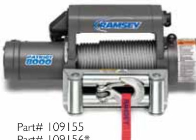
Part# 109155 Part# 109156*