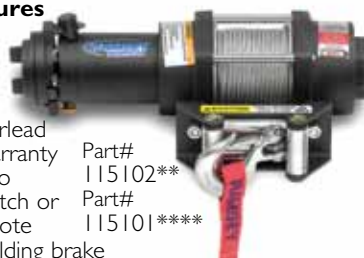
Part# 115102** Part# 115101****