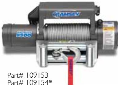
Part# 109153 Part# 109154*