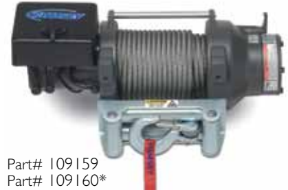
Part# 109159 Part# 109160*