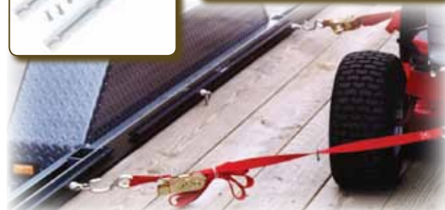
68" Black - Part #BXR68B 68" Clear - Part #BXR68S