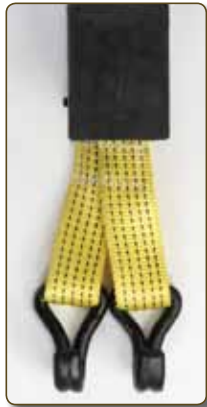
Part # LM-100