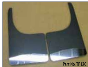
Part No. TP120