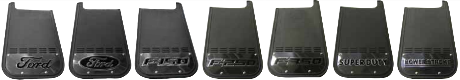
CLASSIC FORD FULL: 1219-FS01 MOON: 1219MC-FS01

• Available in Ford logo bottom plates, in Die stamped with inlay or Laser cut