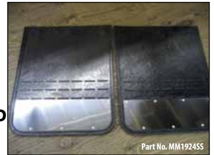
Part No. MM1924SS